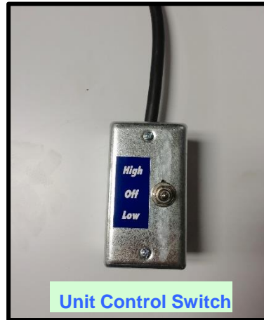
Unit Control Switch