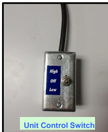
Unit Control Switch